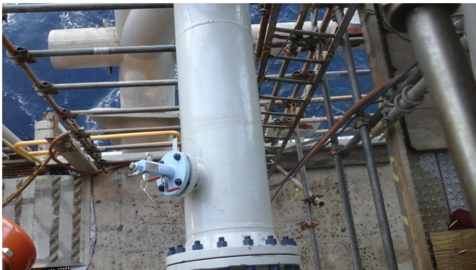
Figure 2: Installed sample probe for a sampling system